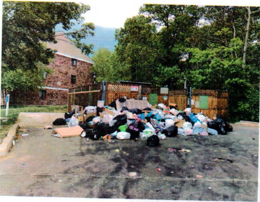
Rosemont Court Apartments, May 23, 2021