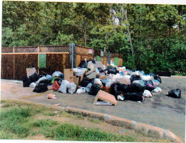
Rosemont Court Apartments, May 31, 2021